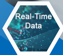
REAL TIME DATA

NOT INCLUDING HARDWARE. 5 VEHICLES/ ASSET OR LESS